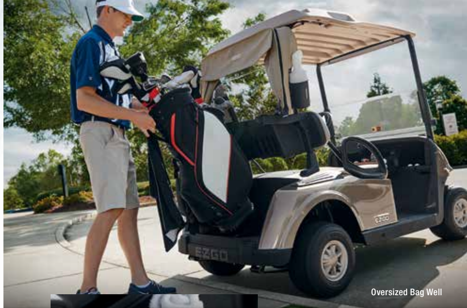
Oversized Bag Well