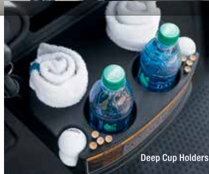
Deep Cup Holders