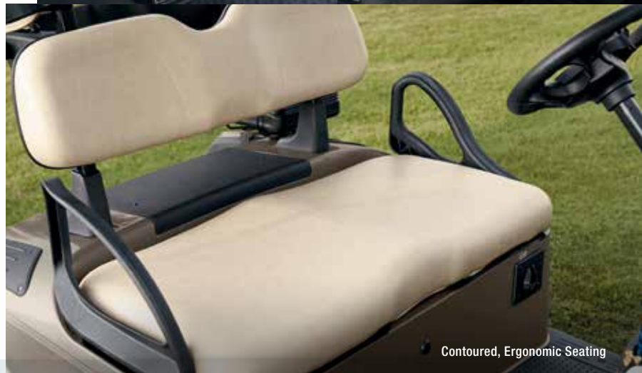
Contoured, Ergonomic Seating

SEE WHAT GOLF'S BIGGEST NAMES SAY ABOUT E-Z-GO AND THE RXV.